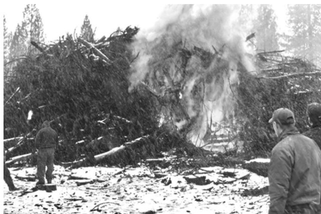
Figure 1. Open pile burn of forest fuel treatment woody biomass in Lake Tahoe Basin.

The Placer County Air Pollution Control District (PCAPCD), with responsibility for managing air quality in Placer County, shares regulatory authority over open burning with local fire agencies. Open burning is problematic because of the limited time of year it can be conducted, subsequent monitoring of smoldering piles for days after they are lit, and the production of significant quantities of air pollutant emissions and esthetically unpleasing residuals (blackened logs and woody debris). The PCAPCD expends significant resources reviewing smoke management plans, issuing burn permits, inspecting burn piles, and responding to complaints from smoke.